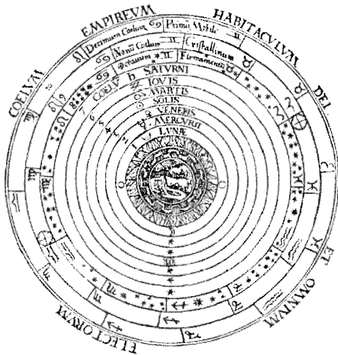
Figure 4. The Ptolemaic Universe

The goal of human life was to rehabilitate the soul or psyche , which had become corrupted and weak when it separated from the Good and descended through the planetary realms, literally falling from the sky into the human body. To reinvigorate the soul, the human being must live in accordance with the most important virtues, relying on reason to subdue the soul's desires and emotions. Once the psyche was rehabilitated and released from the body at the moment of death, it would be pure enough and strong enough to ascend through the seven planetary realms and reunite with the Good.